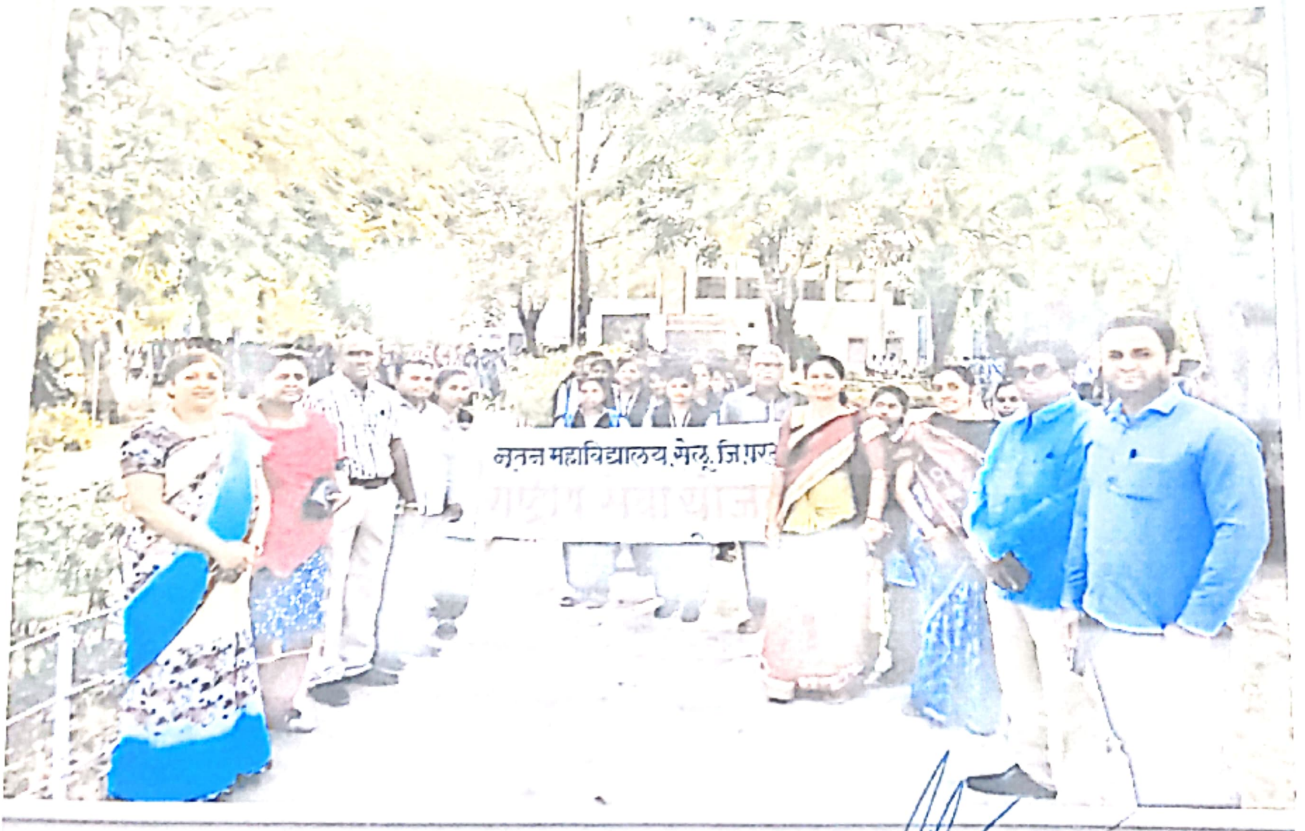
PRINCIPAL Nutan Mahavidyalaya SELU, Dist. Parbhani,